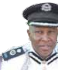
Richard Mweemba Police College