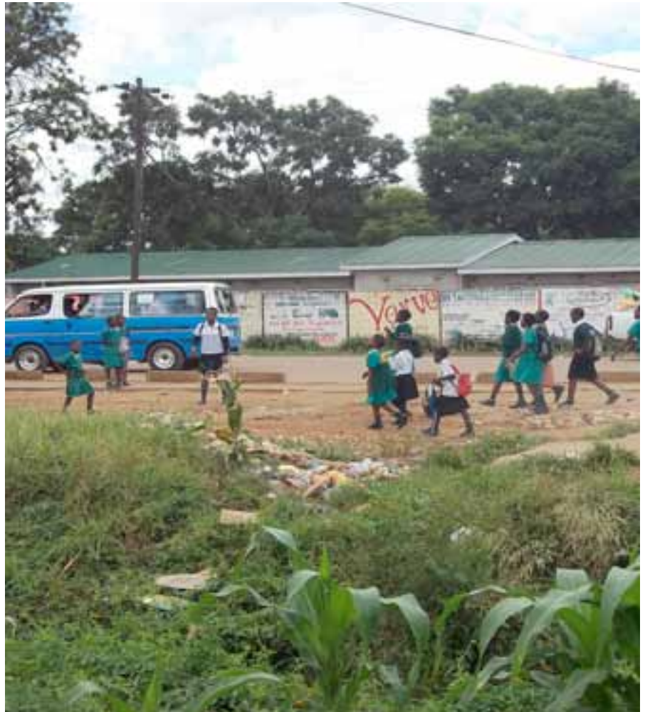
From school children get swallowed in traffic. At this point they need everyone's care

They sneak out of homes late for their errands whether progressive or retrogressive and leave us asleep in candle light. Oh my dear God, they are just informed that an inferno has engulfed their house, and by the time we realize, we are turned into small bolls of black coal and ashes, long forgotten