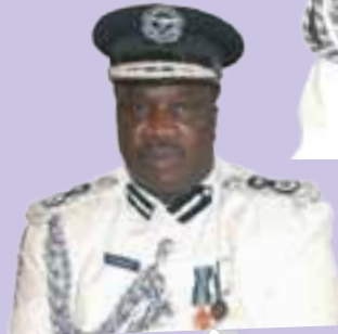
Graphael Musamba Commissioner of Police