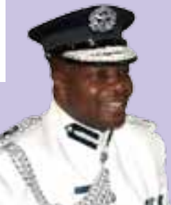
Charles Kaonga Commissioner of Police Special Duties