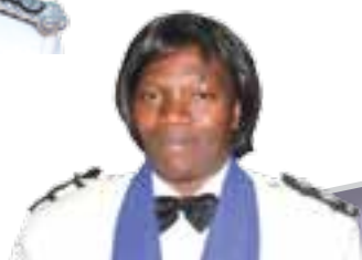
Stella Libongani Central